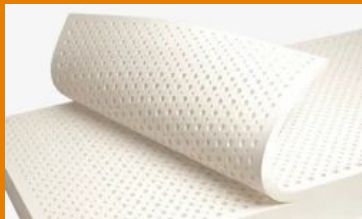
Arpico Organic 100% Pure Certified Natural Latex Rubber Foam Mattress