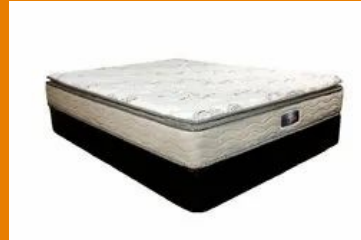
Boston Bonnell Spring Pillow Top Bed Mattress