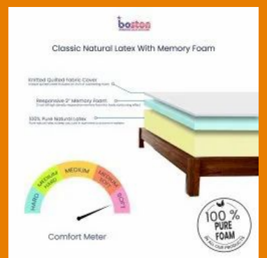
Latex Memory Foam Mattress