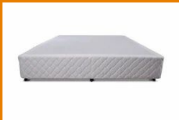
Spring Bed Base