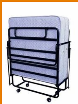
Orchid Roll Away Bed