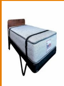
Carnation Roll Away Folding Bed