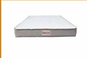
Boston Hotel Comfort HR Foam Bed Mattress