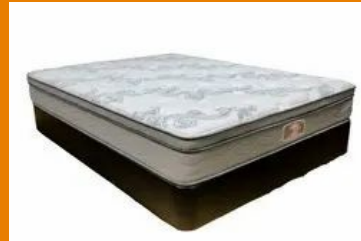
Boston Classic Bonnell Spring Memory Foam Bed Mattress