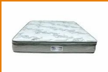
Boston Classic Memory Foam Bed Mattress