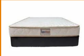
Natural Latex Bed Mattress