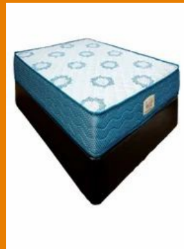
Orthopedic Bed Mattress