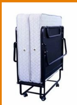
Daffodil Roll Away Bed