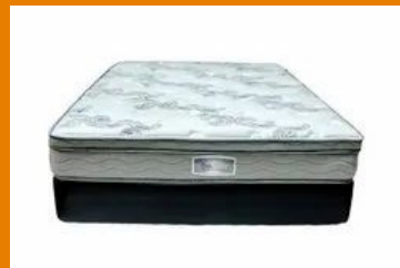
Boston Classic Bonnell Spring Memory Foam Mattress