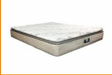
Bed Spring Mattress