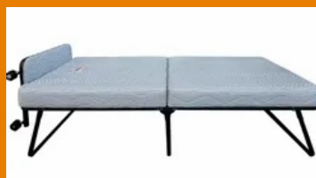
Blossom Roll Away Folding Bed