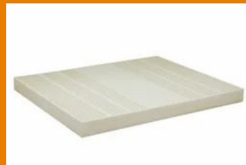
Arpico 100% Pure Certified Natural Latex Foam