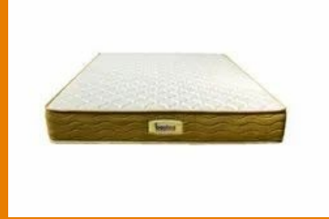
Boston Classic Pocket Spring Mattress