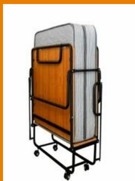
Marigold Rollaway Bed